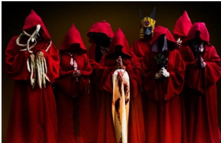
The Red Vein Army (RVA) launches their first full haunted house on Oct. 14, inviting Richmond scare-hunters to experience the interactive story of a paranormal witch-hunt.